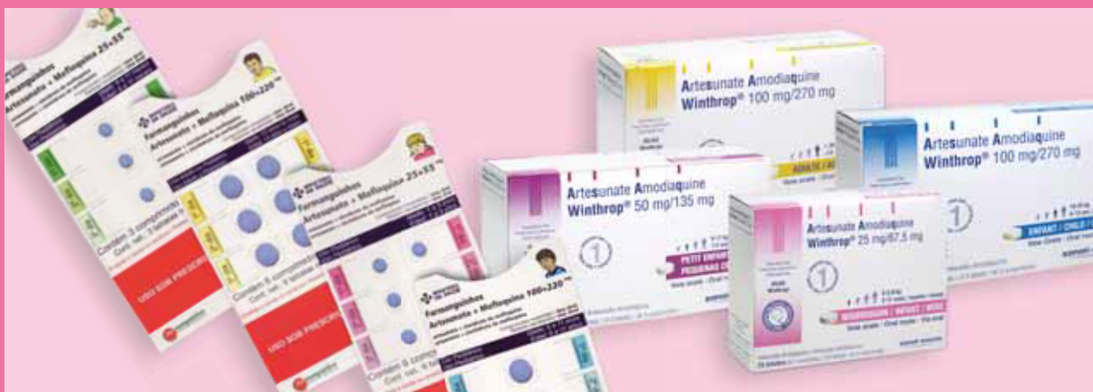
ASAQ and ASMQ, the two antimalarial treatments developed by DNDi and partners.

› ASAQ and ASMQ , fixed-dose combinations of artesunate (AS) with amodiaquine (AQ) or mefloquine (MQ), were the first projects to be undertaken by DNDi; their development was based on WHO recommendations for artemisinin-combination therapies to treat malaria in 2001. Their development was overseen by the Fixed-Dose Combination Therapy (FACT) Consortium, formed in 2002, with the aim of developing field-adapted formulations that would be easy to administer to all age/weight categories of patients, but particularly infants and young children, and which were able to withstand tropical conditions.